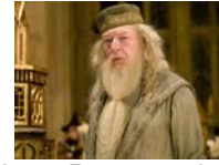
Harry Potter and the Goblet of Fire

The story continues. Harry is another year older and facing new challenges at Hogwarts. There will be a Wizard's Contest this year and only one Wizard will win. It is a dangerous contest and open only to those 18 or older.