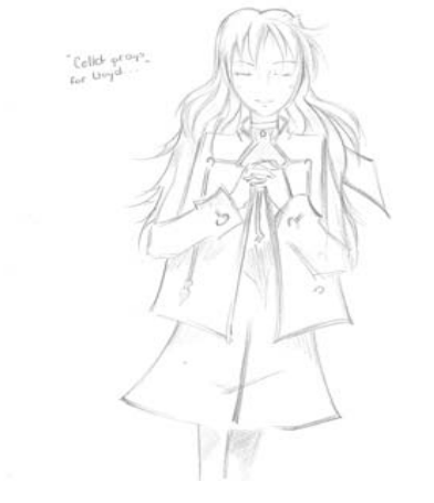
Collet prays for Lloyd...