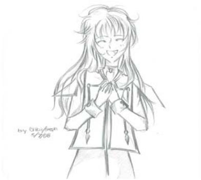
By Cribi/Steph 5/7/08