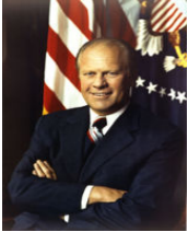
GERALD FORD 1913-2006

Gerald Rudolph Ford (originally born Leslie Lynch King, Jr.) was born in Nebraska. His mother divorced when he was young, moved to Michigan and remarried Gerald R. Ford Sr. who adopted her son and renamed him. Ford met his biological father when he was a high school senior. He wrote in his memoir that he broke down and cried that night and was left with the image of "a carefree, well-to-do man who didn't really give a damn about the hopes and dreams of his firstborn son." That moment in time did not stop him from reaching his full potential in life. Ford was an active youth who participated in scouts, sports, hobbies, served in the US Navy during World War II, and many other activities.